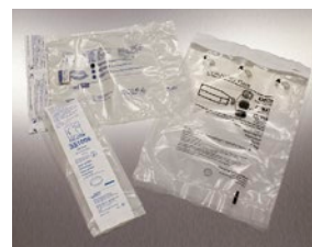
Plastic bags for cell culture dishes, plates, and flasks