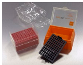
Pipet tip racks,* lids,* plastic bags, and shrinkwrap

Place the plastic packaging from the listed Corning, Costar®, Falcon, or Axygen products in a box. (Pack the box tight! We pay the recycler by the box. There is no charge to you.)