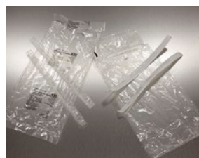
Serological pipet plastic wrappers,** paper/plastic wrappers, and plastic bags