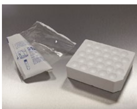
Centrifuge Tube plastic bags and styrofoam racks